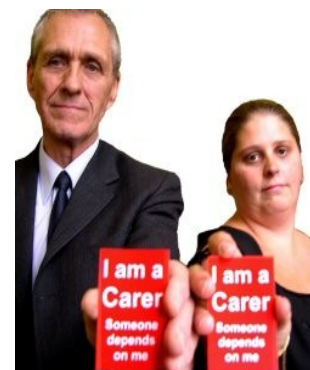
Many people are informal carers — not just paid professionals

For more information, visit the website http://www.equalityhumanrights.com/legal-and-policy/inquiries-and-assessments/inquiry-into-home-care-of-older-people .